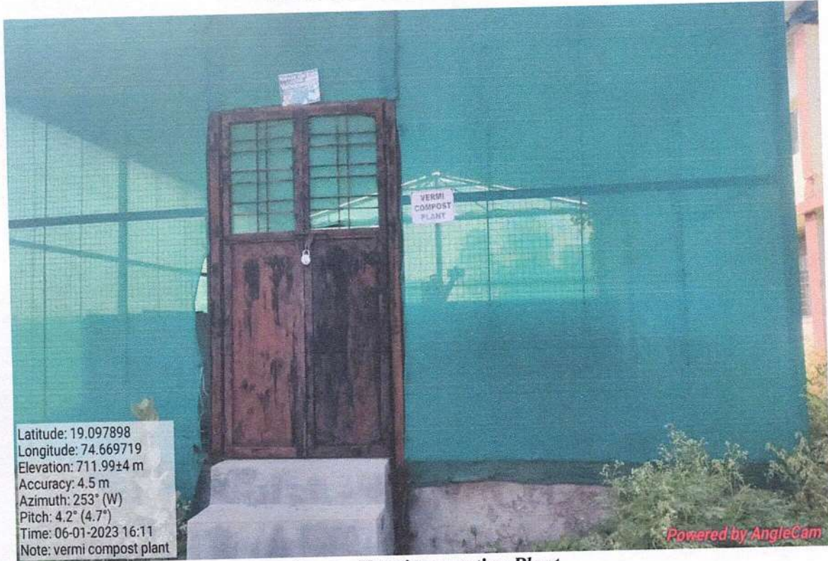
Image: Vermicomposting Plant